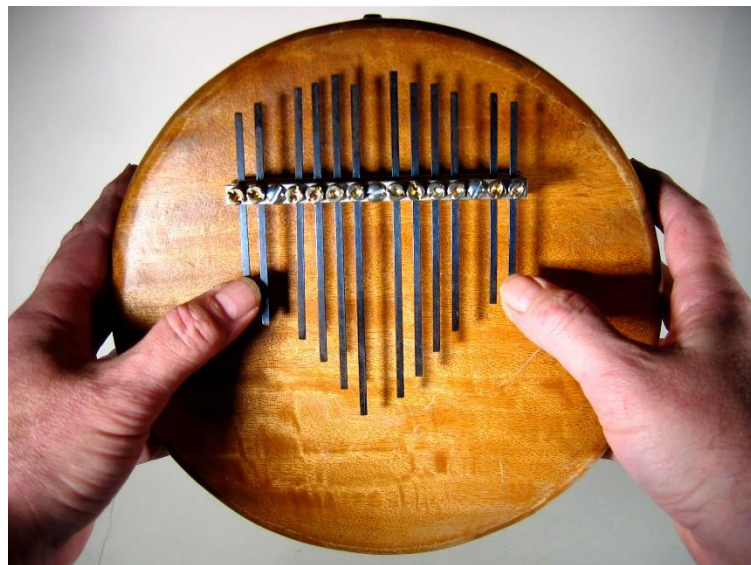
A beautiful (serious) version from Make Magazine Instructions here: https://makezine.com/projects/thumb-piano/